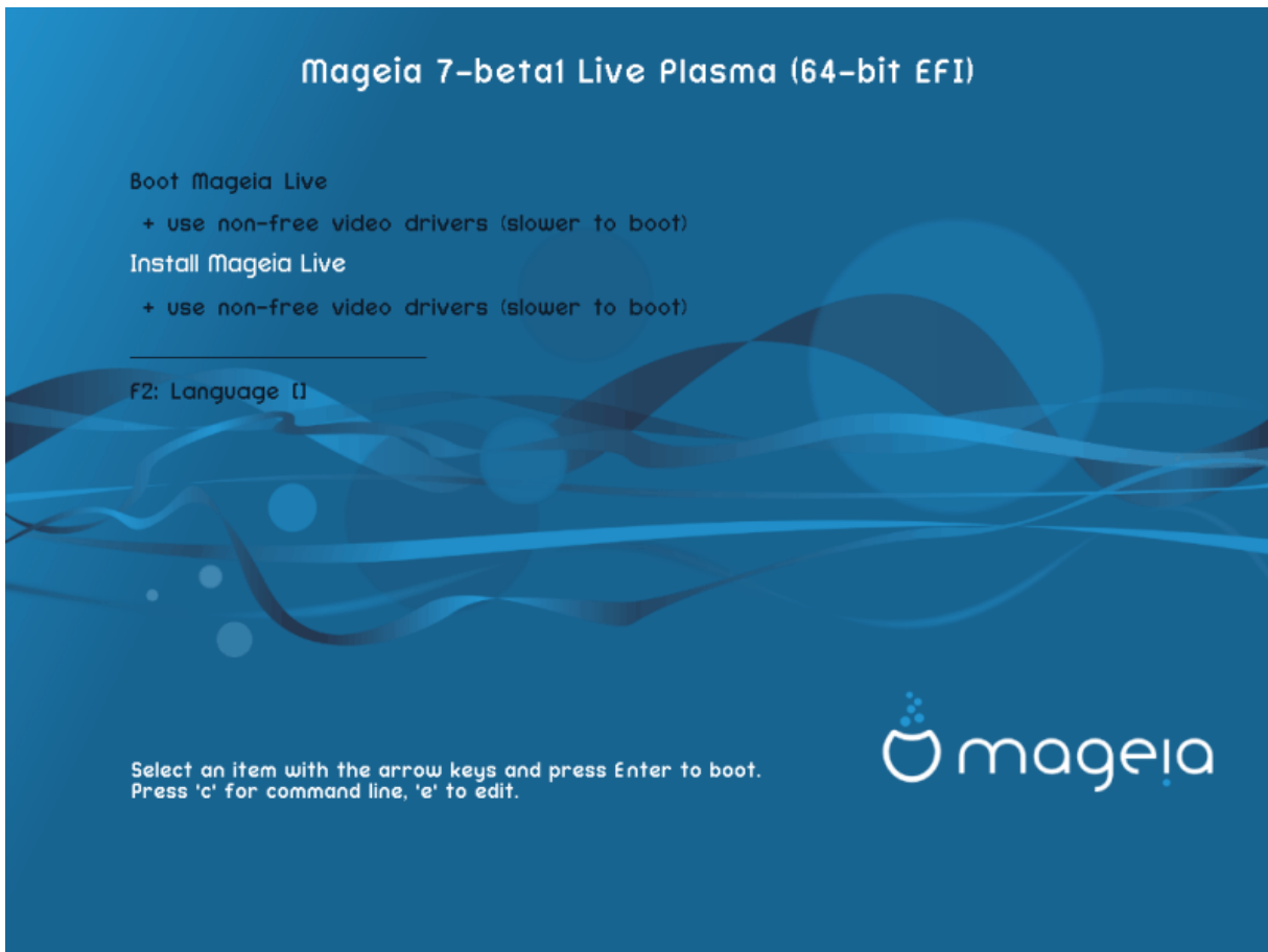
First screen while booting in UEFI mode