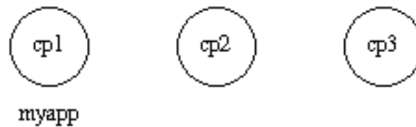
Figure 9.1: Application myapp - Situation 1

Similarly, the application must be stopped by calling application:stop(Application) at all involved nodes.